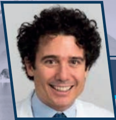
GIUSEPPE ESPOSITO - rising star's nightmare