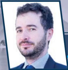
LUCA RICCIARDI - rising star's nightmare